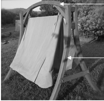
Top Arch Piece