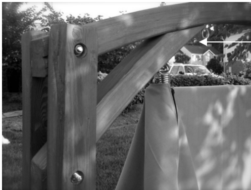
Long Angled side of Arch Support