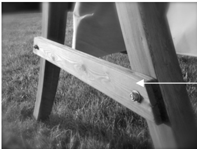
Straight Lower Leg Support