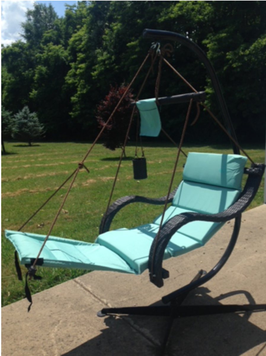
Chase lounge extended out.

Regarding any questions about our products please contact your sales rep. or visit our website.