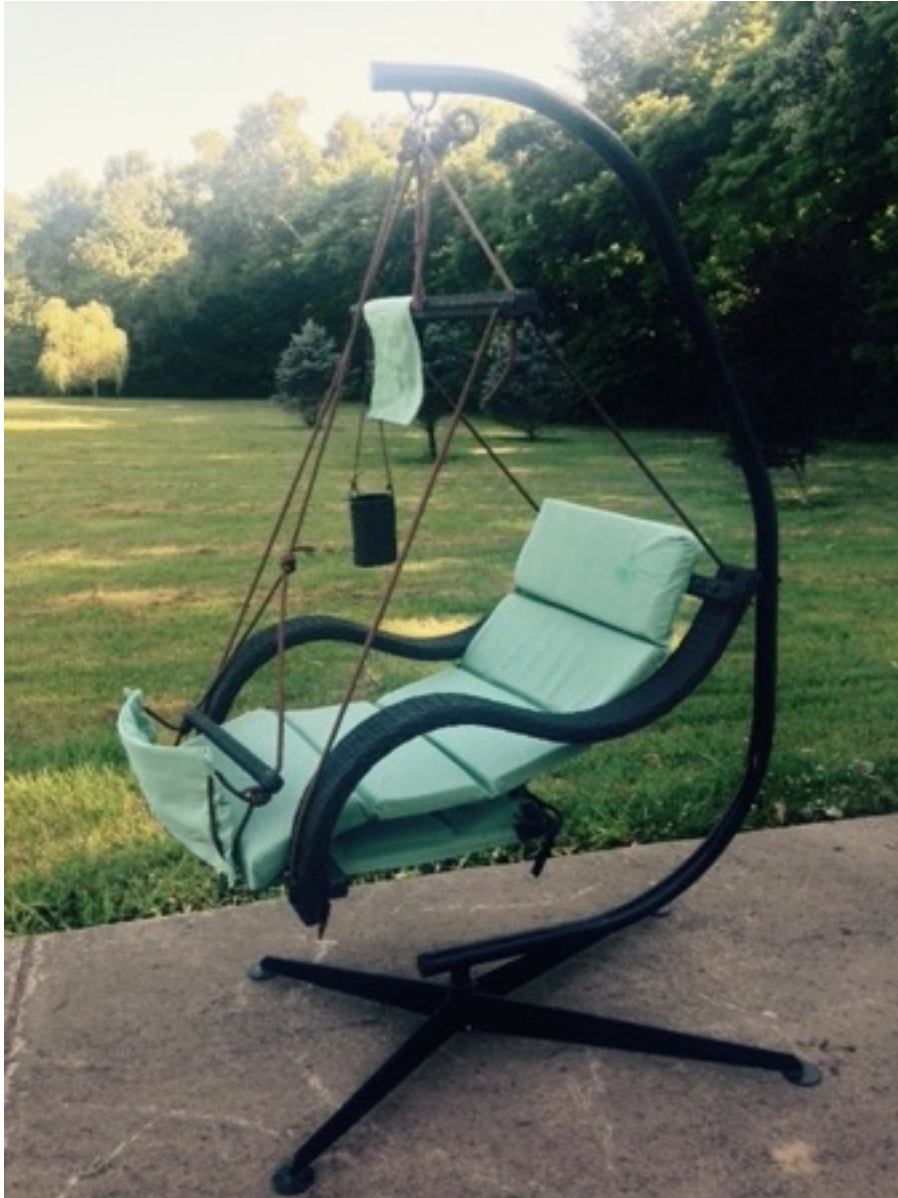
Chase lounge tucked under using regular footrest.

Please note: EZ HANG CHAIRS and all agents or representatives thereof cannot assume responsibility for special, indirect, or consequential damages or contingent liability for use of this product in a manner not expressly intended by the manufacturer. End consumer is ultimately responsible for verifying proper installation of eye-lag/hook assembly according to guidelines explained here within.